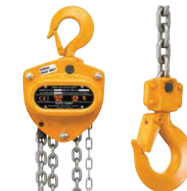
Robust hook latch For increased load-bearing capacity