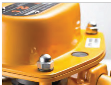
Cap nuts To protect the thread