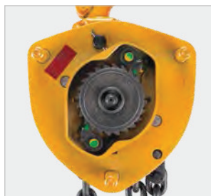
Two retaining pawls Each with double-pawl spring system for increased safety