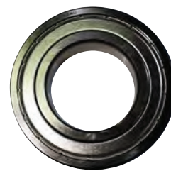
Sealed bearings To protect against dust and moisture