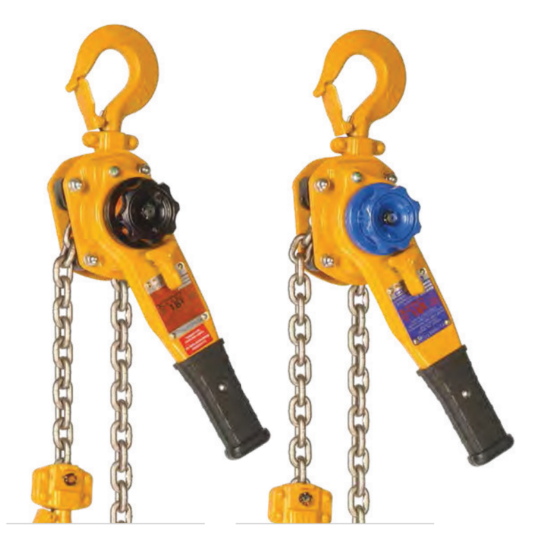
LB OLL with overload limiter