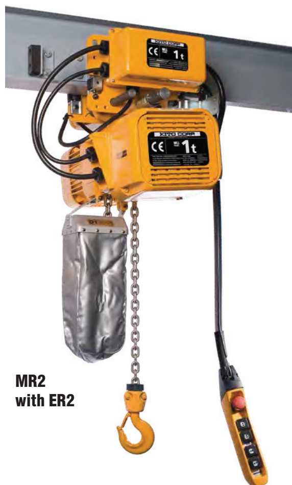
MR2 with ER2