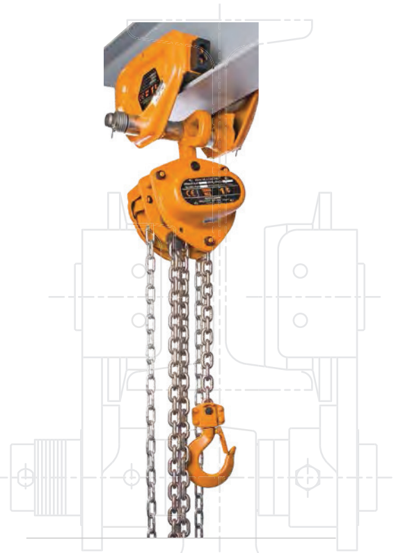
TSP with connector C for hand chain block