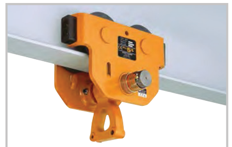
TSP plain trolley 3,000 kg to 5,000 kg