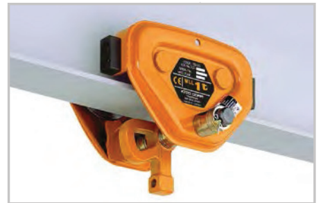
TSP plain trolley 125 kg to 2,000 kg