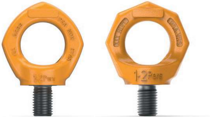
PSA INOX-STAR (1)